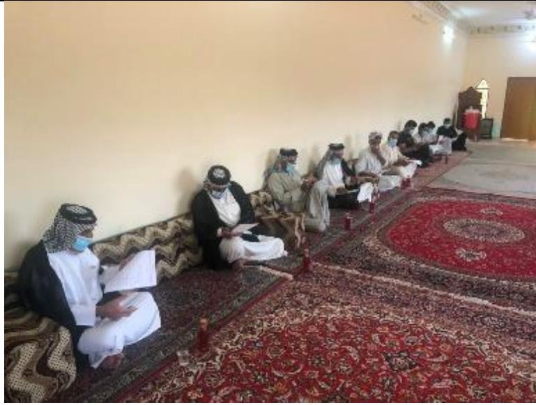
Public Consultations at ALMUSLIM Village