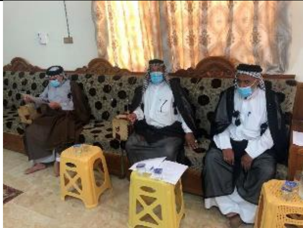
Public Consultations at ALBUHAN Village