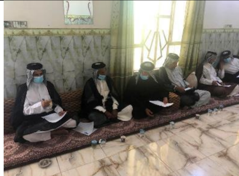
Public Consultations at AL-ZEREEF Village